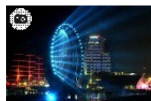
Yeosu Expo 2012