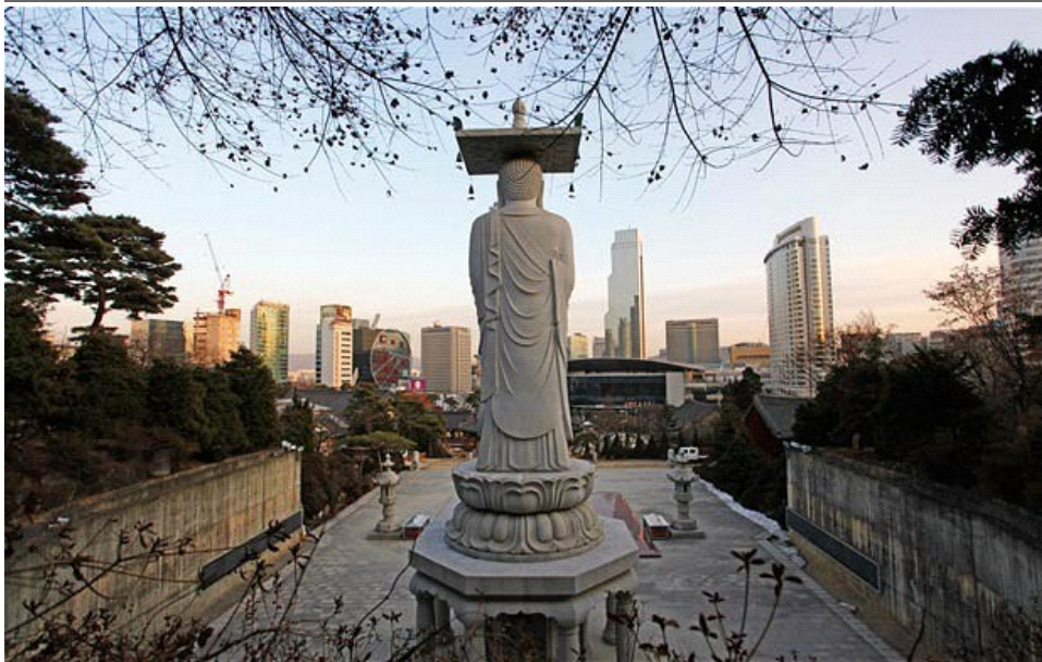
A buddha statue looks out over the Seoul skyline