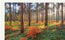
The week in travel