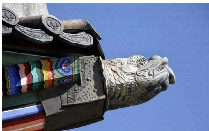
A detail from the Gyeongbok Palace

I'm inclined to think that as modern as it is, Korea is equally enamoured with its past. Indeed, it is this tension that makes it such a compelling destination. While the struggle to preserve Confucian-inspired traditions is strong (on the subway I witness several senior citizens chastising a group of youths for dyeing their hair), so too is the drive to embrace change. In fact, Gyeongbok Palace could not be better placed to offer a first-hand look at what has come of Seoul's efforts to remain ancient yet ageless.