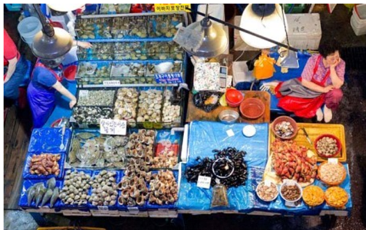
The Noryangjin fish market

But some things about this city are impervious to evolution, which is as it should be. Perhaps one of the best examples is the Noryangjin Fish Market, where little has changed since it opened in 1927. Not many tourists venture to this authentic seafood market where almost every conceivable creature from the sea is for sale. I load up on coffee and head out just after midnight to witness what I had been told was a must-see event: the fish auctions.